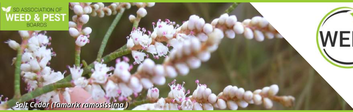
Salt Cedar (Tamarix ramosissima)