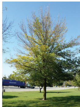
Green ash tree showing decline from EAB infestation.

EAB is difficult to detect when it first infests a tree. The tree can host EAB for 3-5 years before symptoms become noticeable to anyone, including trained professionals. Unfortunately, the population of EAB grows exponentially with each passing year, making early detection key to possible control.