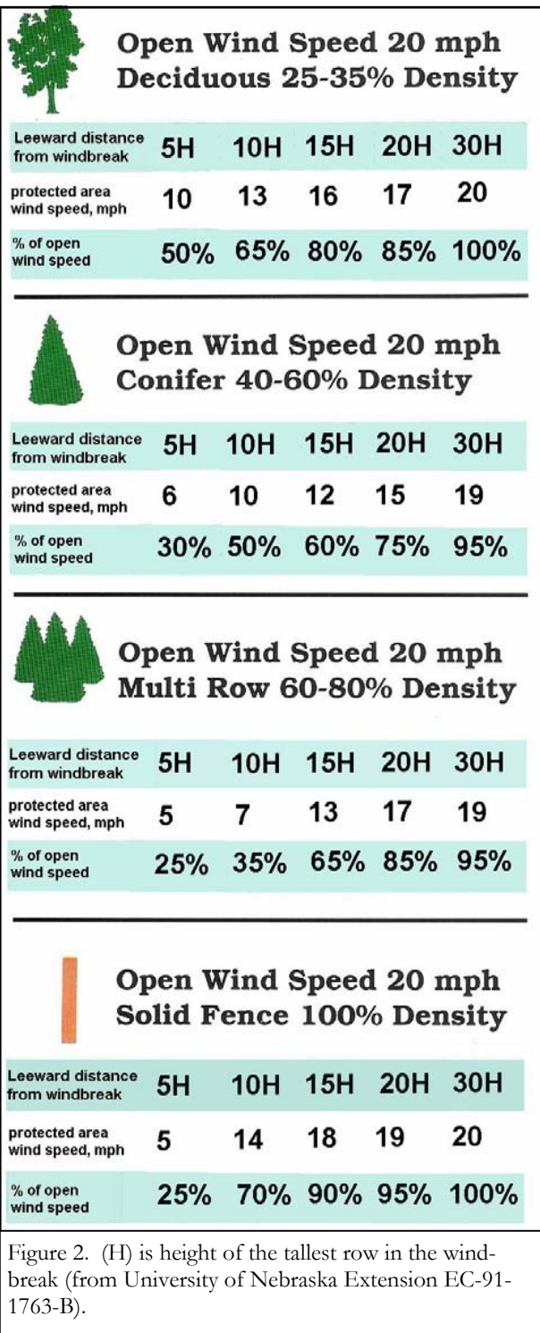
Figure 2. (H) is height of the tallest row in the windbreak (from University of Nebraska Extension EC-91-1763-B).